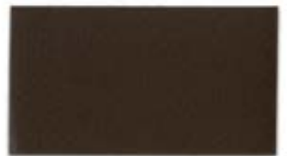
Walnut stain 70.8 in 502V2-2137C