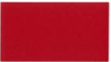
Poppy 70.8 in 502V2-8255C