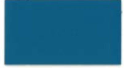
Celestial blue 70.8 in 502V2-50672C