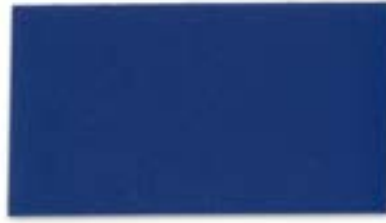
Midnight blue 70.8 in 502V2-2161C