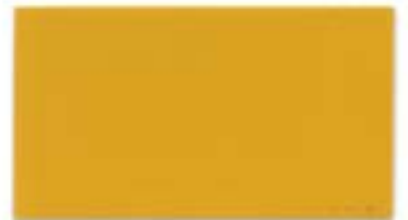
Dijon 70.8 in 502V2-50671C