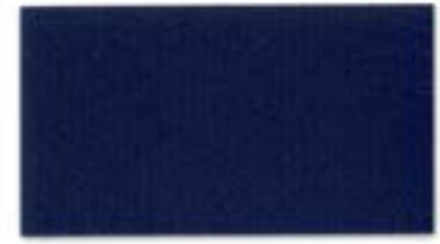
Marine 70.8 in 502V2-1125C