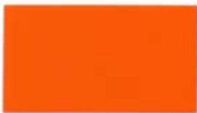
Carrot 70.8 in 502V2-2172C