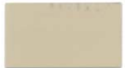
Hemp 70.8 in 502V2-50265C