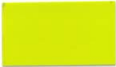
Aniseed 70.8 in 502V2-2157C