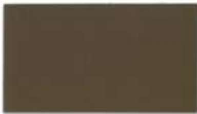
Teak 70.8 in 502V2-50669C