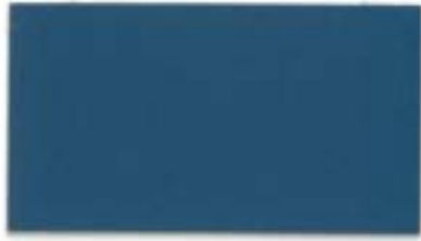
Dark blue 70.8 in 502V2-50673C