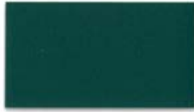
Tennis green 70.8 in 502V2-8056C