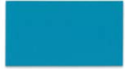
Lagoon 70.8 in 502V2-2160C