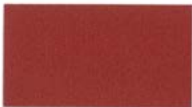
Velvet red 70.8 in