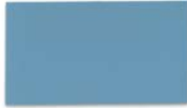
Steel blue 70.8 in 502V2-50676C