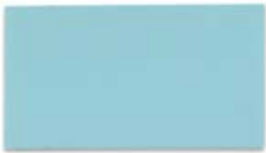
Celadon 70.8 in 502V2-50675C