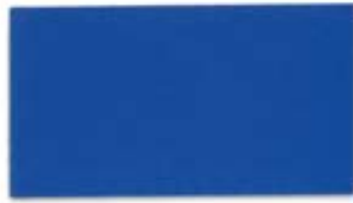
Victoria Blue 70.8 in 502V2-50677C