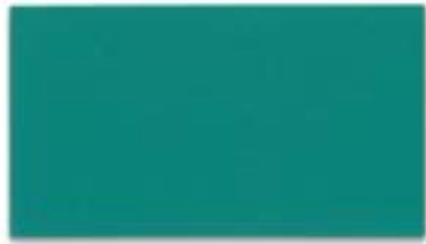
Porcelain green 70.8 in 502V2-50670C