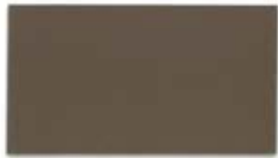
Cocoa 70.8 in 502V2-2148C