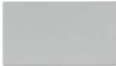
Boulder 70.8 in