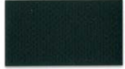
Spruce 70.8 in 502V2-2156C